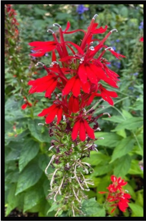
Cardinal Flower Lobelia cardinalis