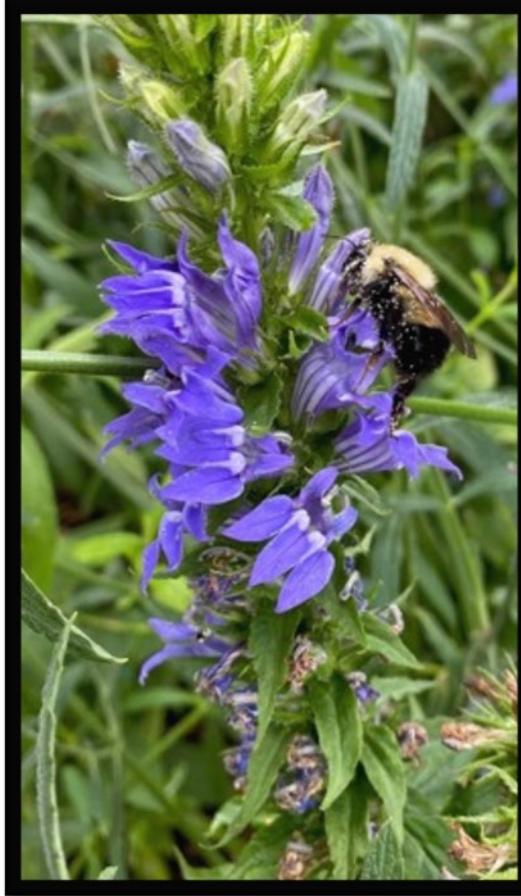
Great Blue Lobelia Lobelia siphilitica